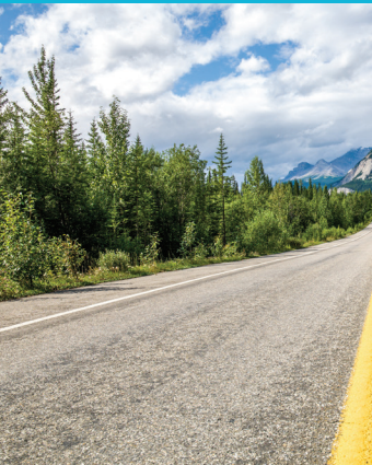
With Astigmatism Correction

Your surgeon can correct your astigmatism during Robotic Laser Cataract Surgery, so you can restore your vision to its full potential.