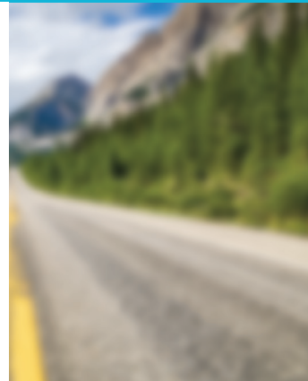
Without Astigmatism Correction

Simulated images after Robotic Laser Cataract Surgery.